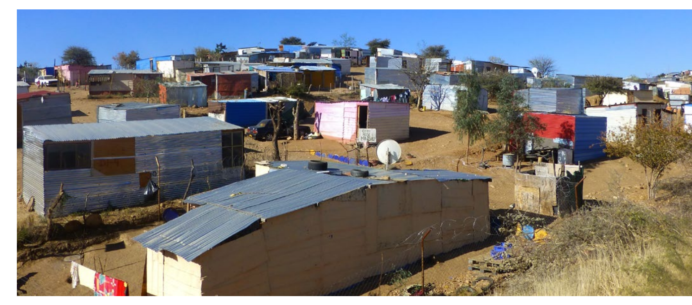
Informal settlement, Windhoek, Namibia