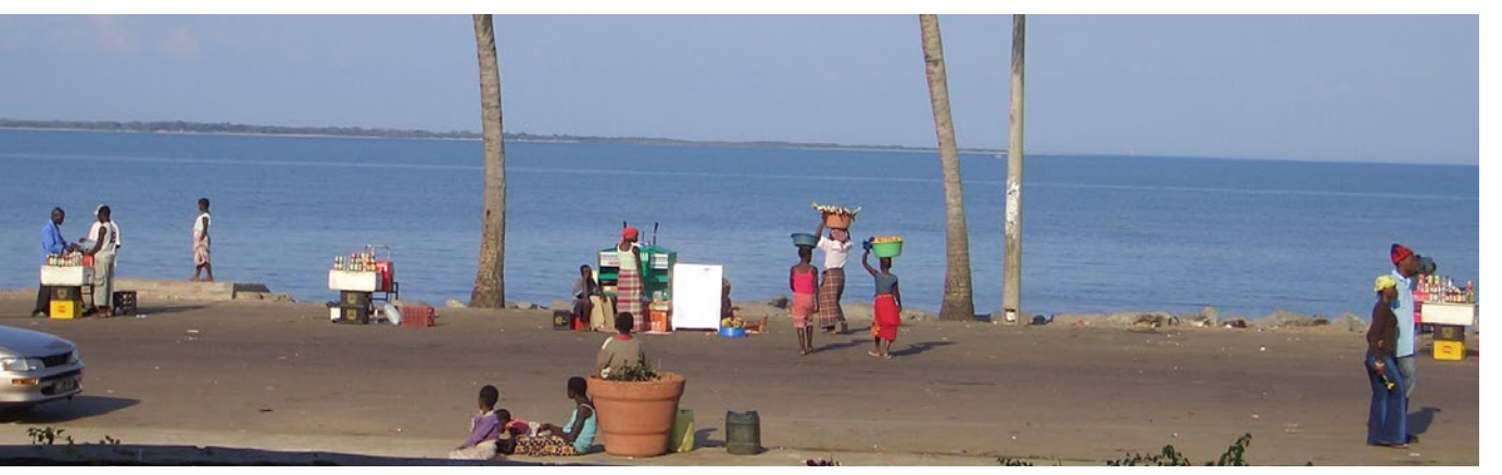
Beach market, Maputo, Mozambique