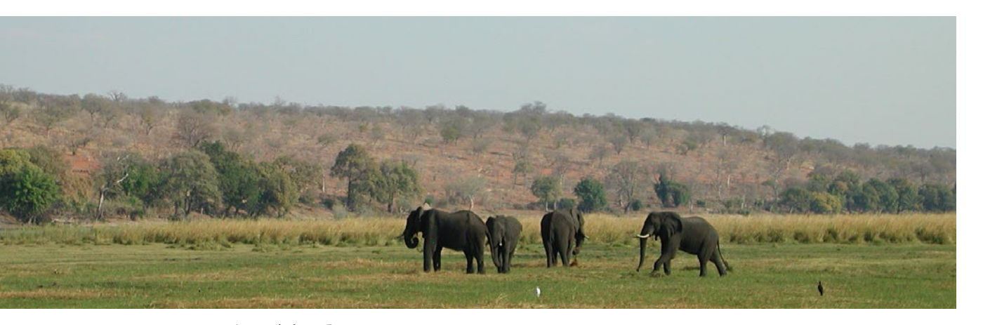
Kasane river delta, Botswana