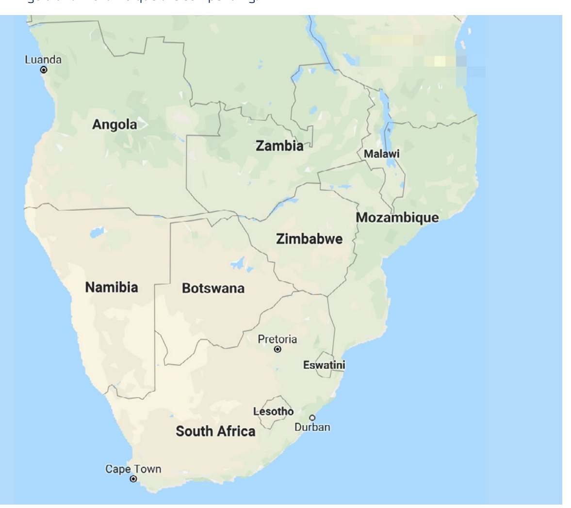
The Southern Africa Region.

This project on "Land Governance in Southern Africa" covers a description and assessment of Land Governance in the Southern Africa Region (Africa mainland south of Tanzania and the Democratic Republic of Congo). The project covers ten countries: Angola, Botswana, Lesotho, Malawi, Mozambique, Namibia, South Africa, Eswatini, Zambia and Zimbabwe. Eight countries are completed while Angola and Mozambique are still pending.