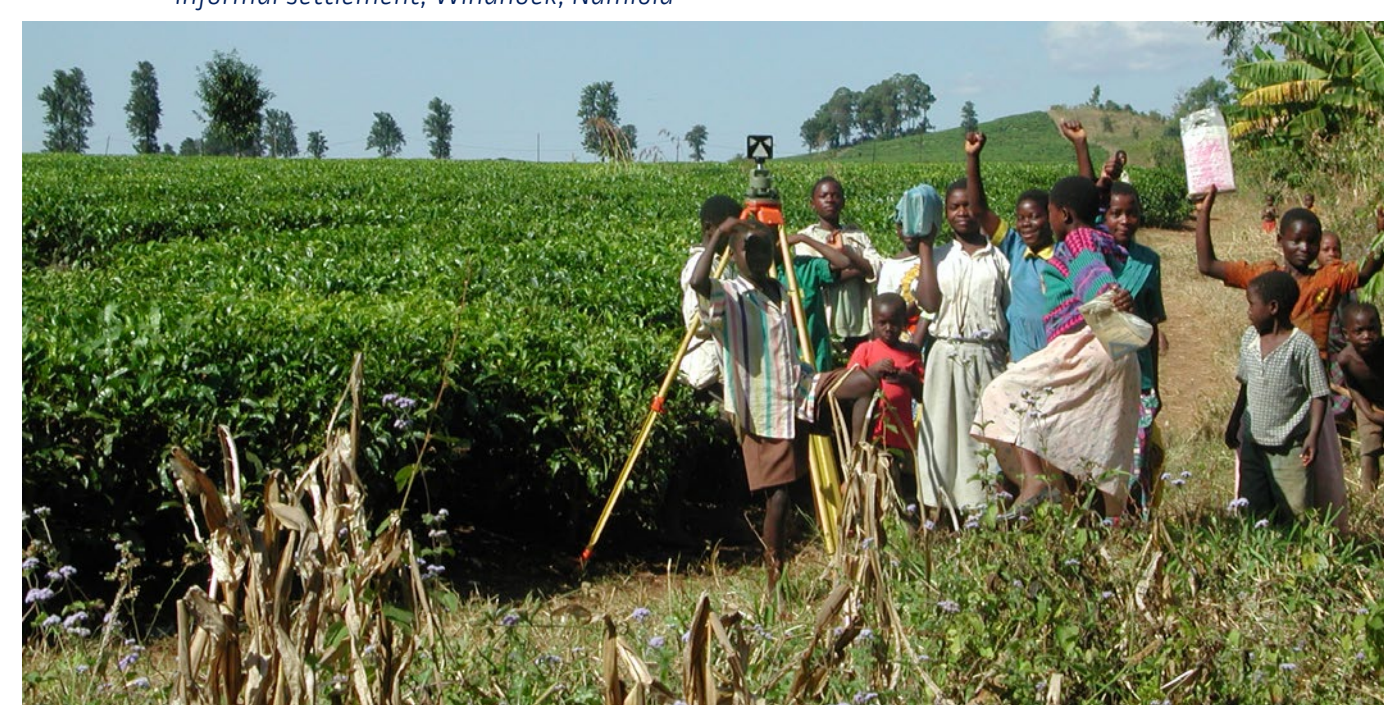
Surveying the future, Malawi