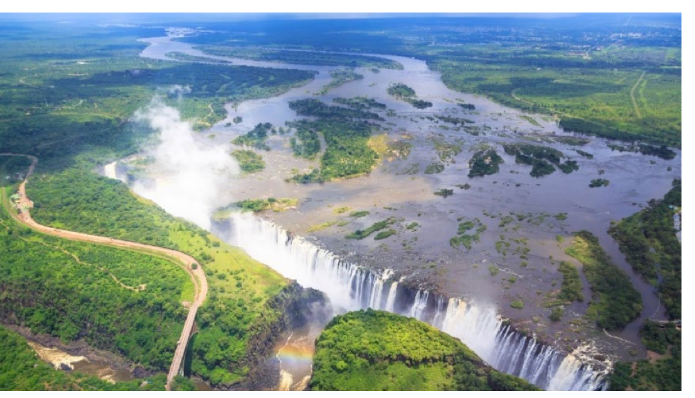
Victoria Falls represent a kind of meeting point of many Southern Africa Countries including Zimbabwe, Zambia, Botswana, Namibia and Angola