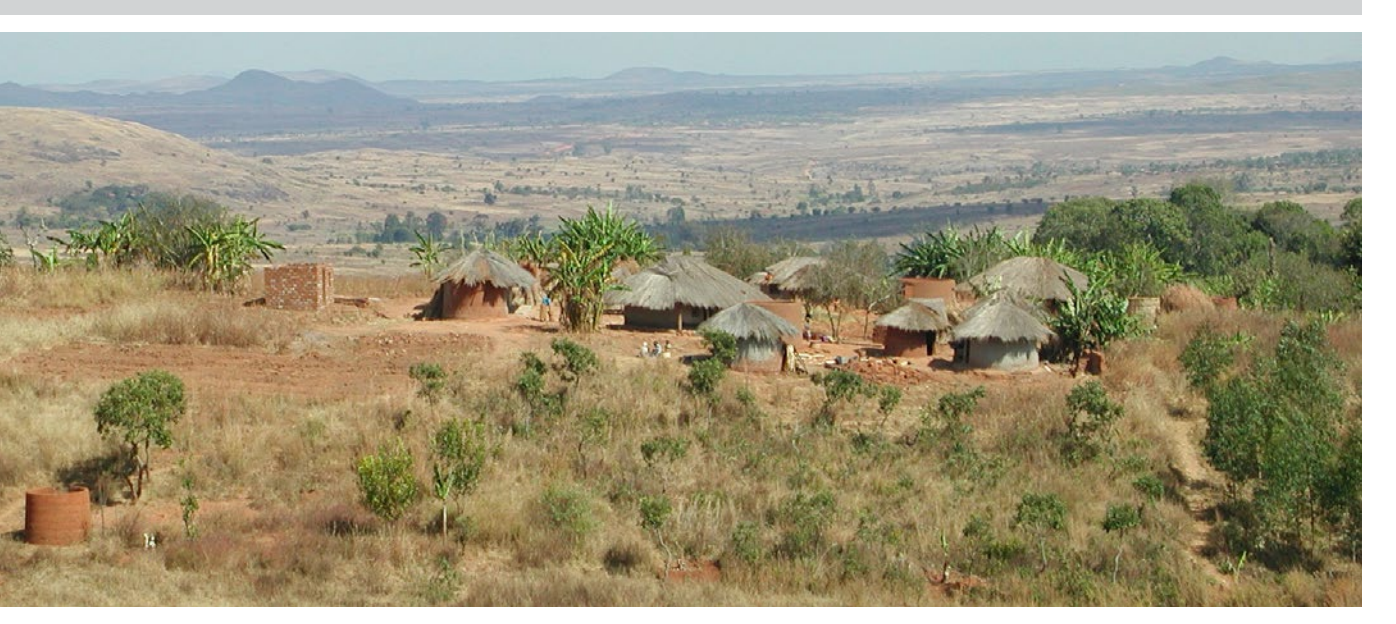
Customary tenure area, Mozambique

Land administration is technically complex and cuts across many disciplines, such as law; information technology; geodesy; geomatics and surveying; economics; urban planning; anthropology; and environmental, social, and political sciences. Some of these fields are rapidly advancing, making it important not to remain with outdated solutions but rather to design systems in a way that anticipates future improvements. A key challenge is also to make trade-offs that help improve overall system performance rather than focus on over- engineered approaches that may be appropriate from a disciplinary perspective but weigh down the system and eventually make it unsustainable. While these trade-offs are ultimately a policy decision, a framework for the land sector can help to identify key areas of concern and guide support for developing an integrated strategy. [World Bank, 2012, 20]